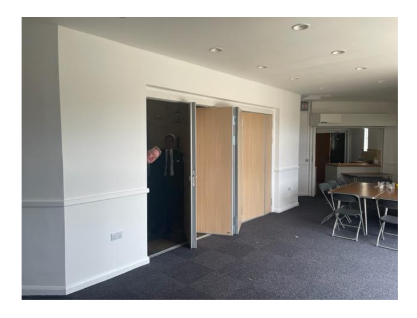
Fr Jeffrey in the new small hall at St Luke's

At a cost of £120,000 the grounds have been fenced off, creating a safe space for outdoor activities, fire exits have been improved, the server's sacristy enlarged, kitchen and toilets replaced, and external storage supplied. In particular, three small rooms have been knocked together to create a useful small hall, which can be opened onto the church. In October, the building work was blessed, the children's choir sang 'Panis Angelicus' by Cesar Frank, and everyone enjoyed a buffet lunch with celebration cakes afterwards.