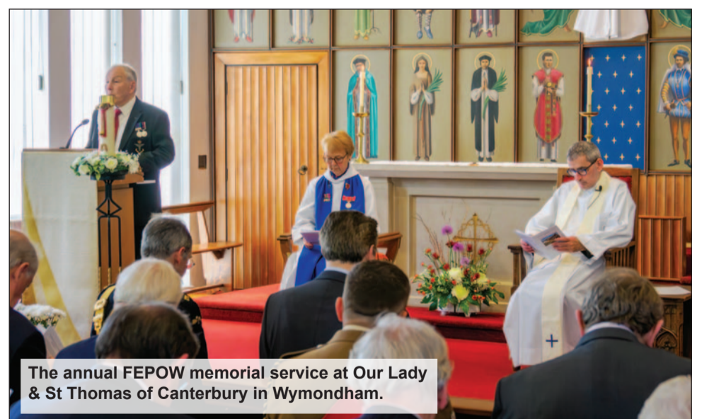
The annual FEPOW memorial service at Our Lady & St Thomas of Canterbury in Wymondham.