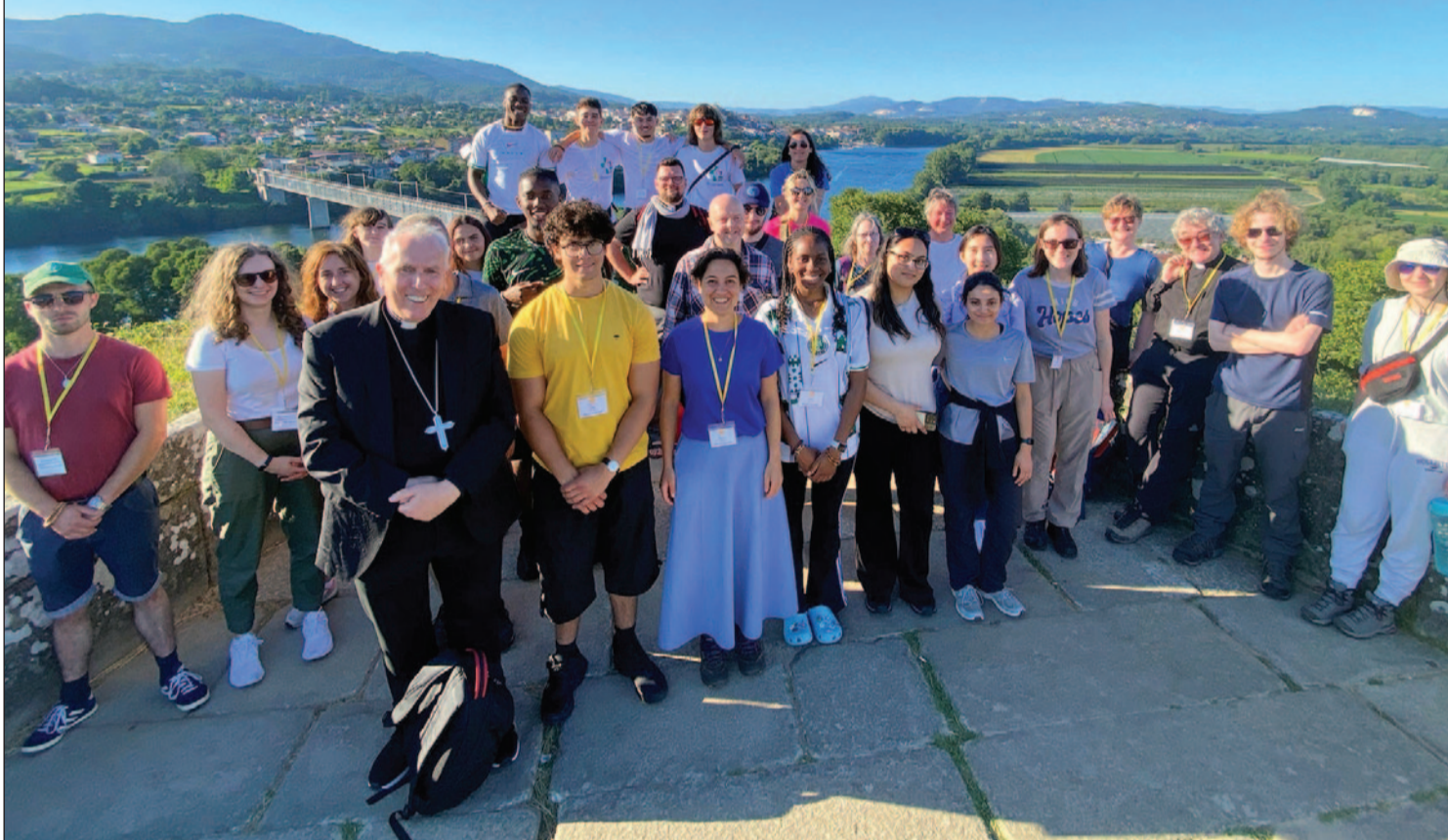
The East Anglia pilgrims with Bishop Peter Collins at the start of their Camino at Valenca on the Portugal/Spain border. For a full picture gallery visit: www.flickr.com/photos/dioceseofeastanglia/

A holy trinity of East Anglian Catholic city mayors – page 9