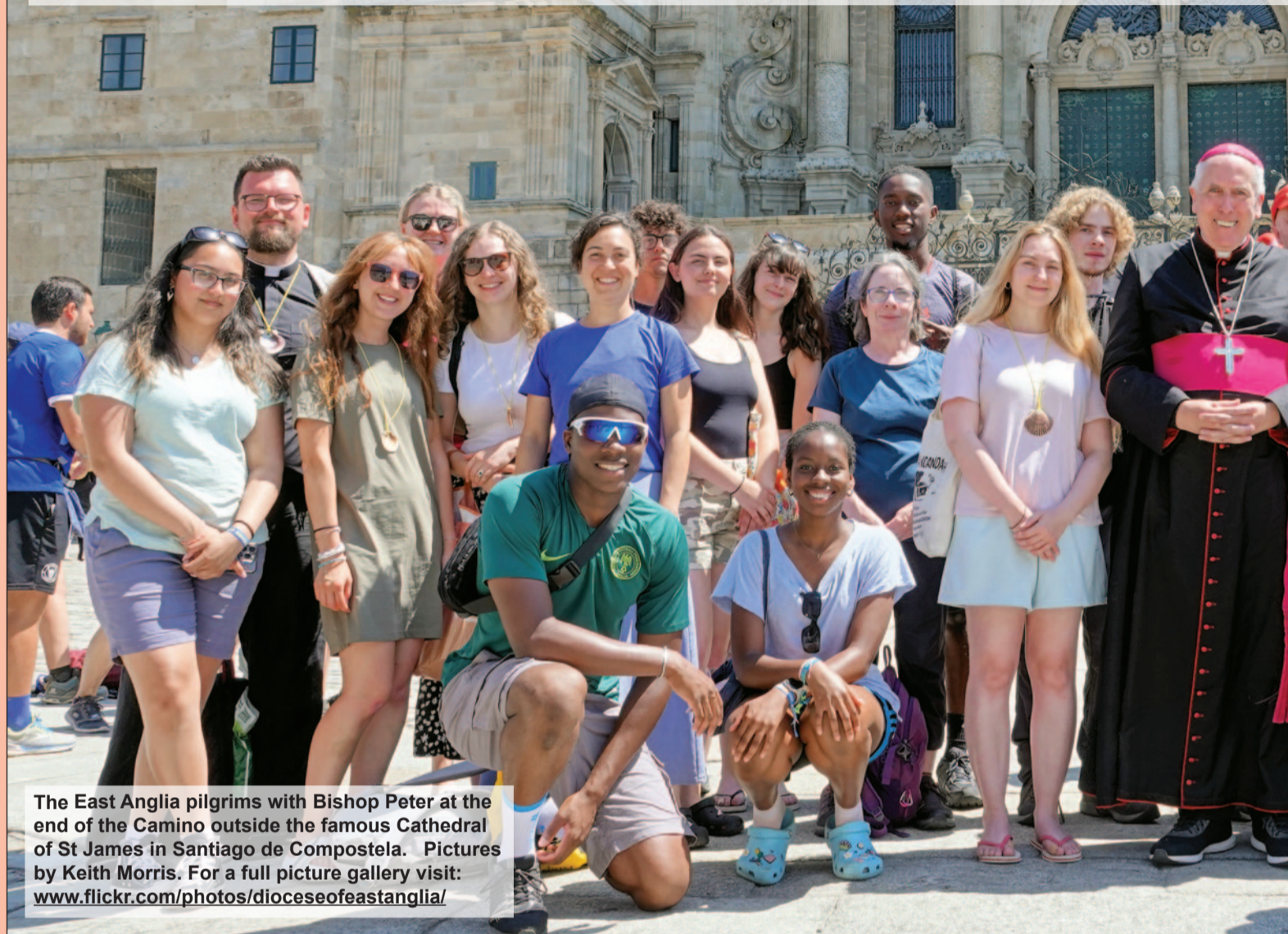
The East Anglia pilgrims with Bishop Peter at the end of the Camino outside the famous Cathedral of St James in Santiago de Compostela. For a full picture gallery visit: www.flickr.com/photos/dioceseofeastanglia/